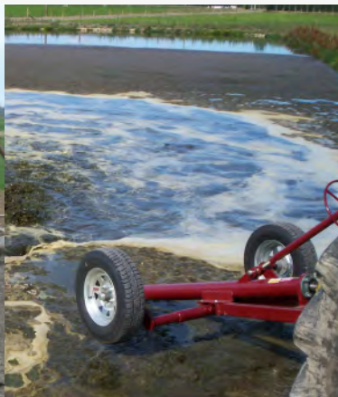
Pond Buster Stirrer for Hire