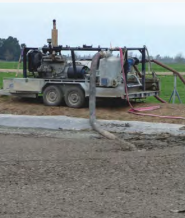
High Volume Pumping Unit